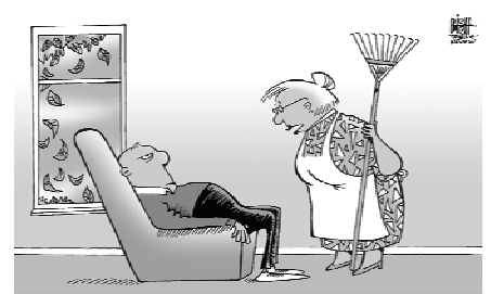
Years ago, you told me that someday you'd really be Raking it in. Here's your chance, sport

Each Wednesday during the month of October, at 7:00 PM, our CWL will lead us in praying the Holy Rosary in the Hall. Please also remember, the Holy Rosary is prayed daily, Monday to Friday at 7:30 AM in the church.